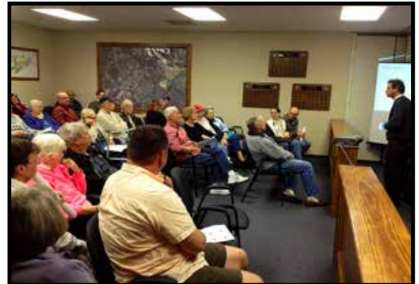
Nearly a hundred interested residents, retailers, landlords, etc turned out for the two public meetings

3 Inscription on a post card advertising Larison's Turkey Farm Inn from the 1950's.