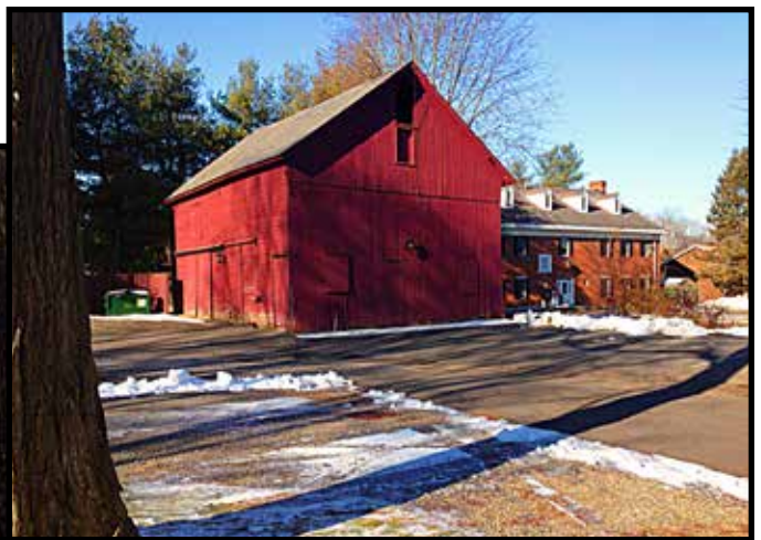
Left: Downtown Chester Decor Right: Historic Barn in a Chester Office Parking Lot

ments at funny angles and in unexpected places. Narrow walkways are secret little worlds of their own as well as short cuts. Gift buying can actually energize your senses and become fun again. Best of all, there is a sense of human scale and an inviting "come hither" emotion that certainly is more satisfying than "please let me find it and get out of here."