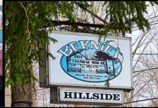
The CHS Holiday party was held at the historic Bernie's Hillside, previously the Depot House and the Anthracite Hotel.