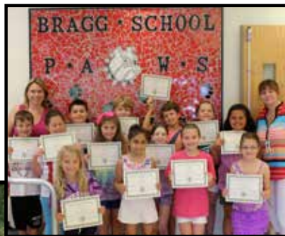
Above: Junior Historians from Bragg School

bingo board. Through this effort, we have reached 130 students and their families and hope they have a new appreciation and respect for the history that surrounds them every day. "Students who visited every site were recognized at an awards ceremony in June as Chester Junior Historians (see photo)".